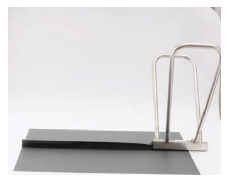
Close only the first 20 cm by hand when closing the second Stage.