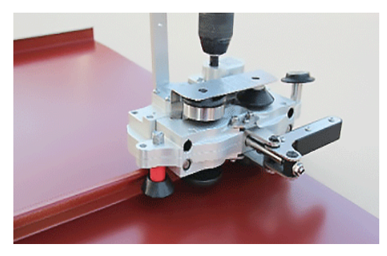
2. Position the ACCUSEAMER with the red marked Wheels over the Seam and start seaming.