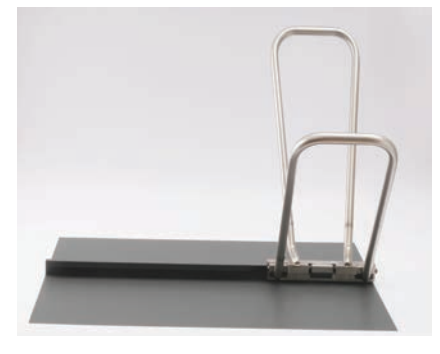
Close the beginning and the end by hand, before running the ACCUSEAMER